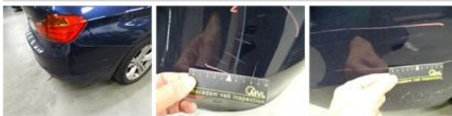
Wing R R, Scratch(es), LI - Repair and paint (complete)