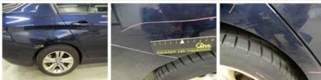
Door F R, Scratch(es), Acceptable