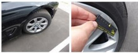
Door panel R L, Scratch(es), Acceptable 0,00