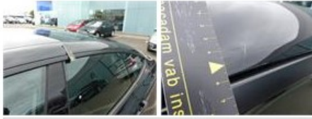
Bonnet, Scratch(es), Acceptable 0,00