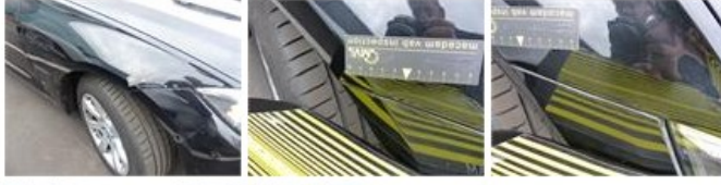
Wing R R, Scratch(es), Acceptable 0,00