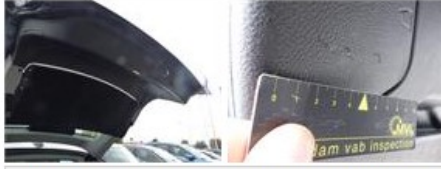
Wing F R, Dent(s), LI - Repair and paint (complete) 268,18