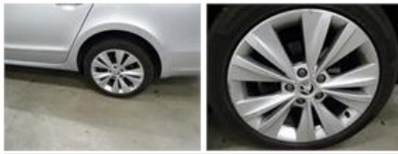
Alloy rim R R, Scratch(es), LI - Repair and paint (complete) 95,00