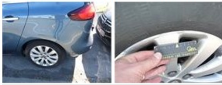
Bumper R, Scratch(es), Acceptable 0,00