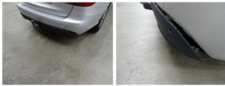
Bumper F, Dent(s), LI - Repair and paint (complete) 211,80