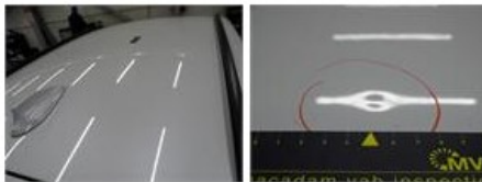
Wing R L, Scratch(es), LI - Repair and paint (complete)