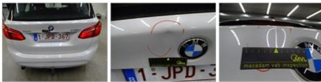
Bumper R, Dent(s) and scratch(es), LI - Repair and paint (complete)