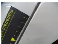
Bumper grille, Broken, E - Replace