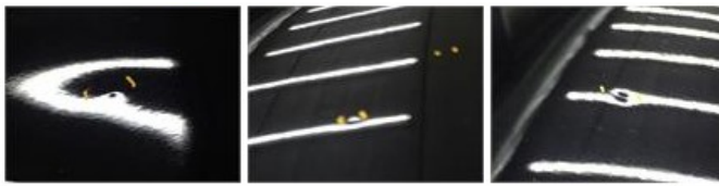
Door F R, Scratch(es), LI - Repair and paint (complete) 318,35