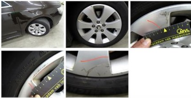
Alloy rim F L, Scratch(es), Acceptable