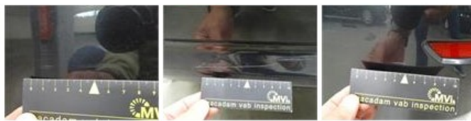
Rearview mirror housing R, Scratch(es), 67 - Polish