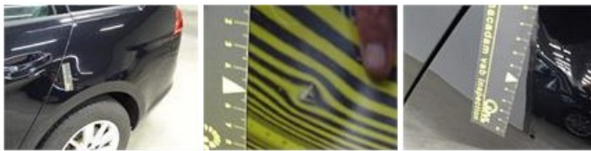
Roof, Chemical polution, LI - Repair and paint (complete) 481,50