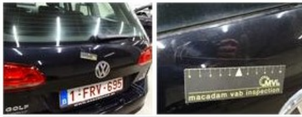
Bumper R, Scratch(es), LI - Repair and paint (complete) 211,80