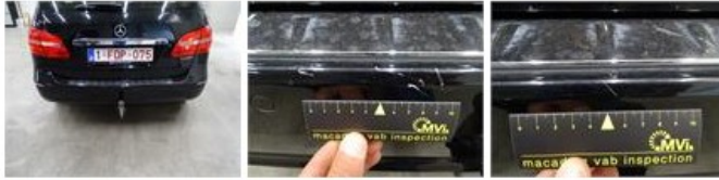
Rear window, Scratch(es), E - Replace 0,00