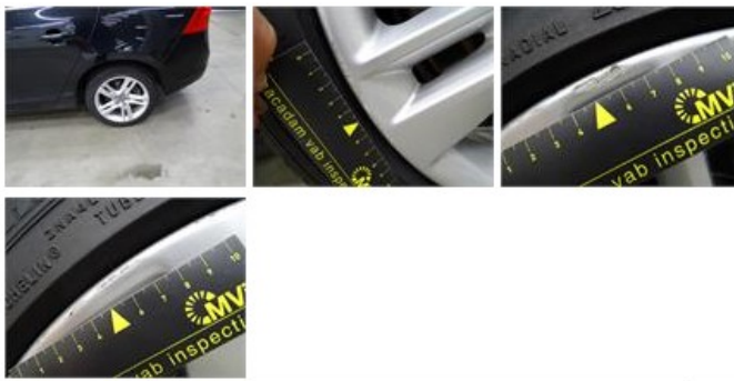
Alloy rim F L, Scratch(es), LI - Repair and paint (complete) 95,00