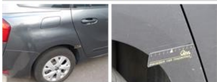
Door R L, Scratch(es), Acceptable