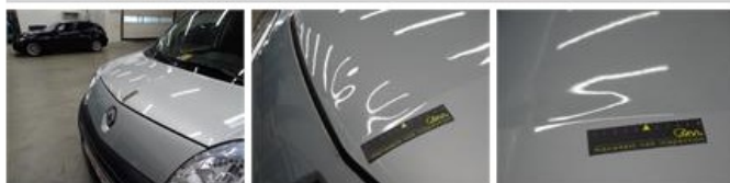
Wing R R, Scratch(es), LI - Repair and paint (complete)