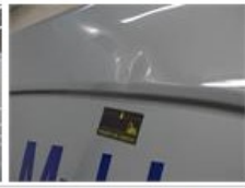
Sill outer R, Dent(s), LI - Repair and paint (complete) 232,88