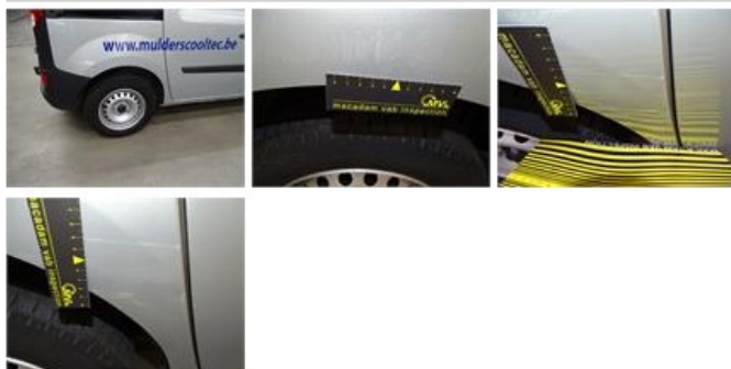
Wing F L, Scratch(es), Acceptable