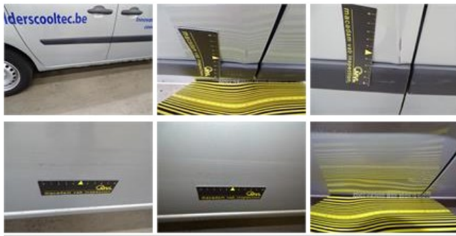
Door F R, Dent(s), PDR - Paintless dent repair