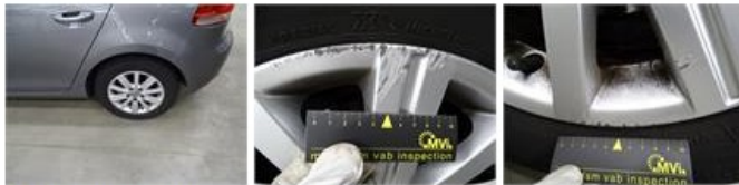
Alloy rim F R, Scratch(es), Acceptable