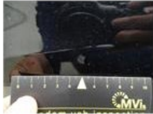
Bonnet, Scratch(es), Acceptable