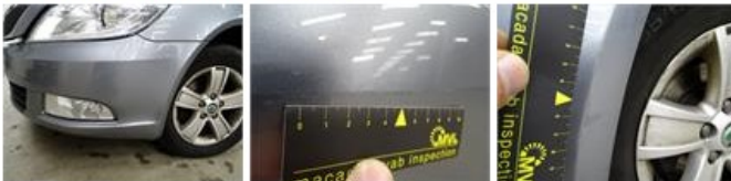
Wing F L, Scratch(es), Acceptable