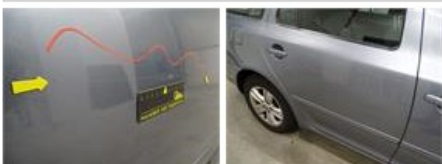
Tailgate, Scratch(es), Acceptable