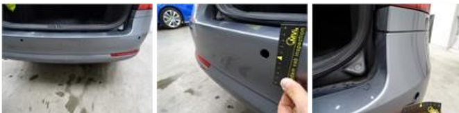
Tailgate, Dent(s), PDR - Paintless dent repair