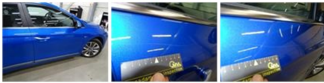
Wing R R, Scratch(es), LI - Repair and paint (complete)