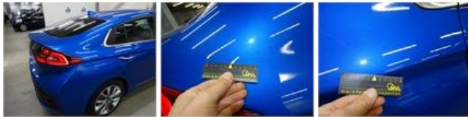
Door F L, Scratch(es), LI - Repair and paint (complete)