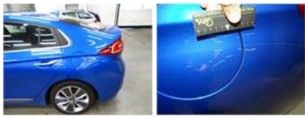
Door F R, Scratch(es), LI - Repair and paint (complete)