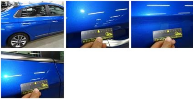
Door R L, Scratch(es), LI - Repair and paint (complete)