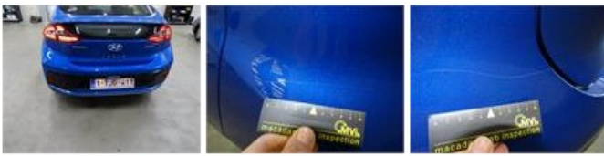
Door R R, Scratch(es), LI - Repair and paint (complete)