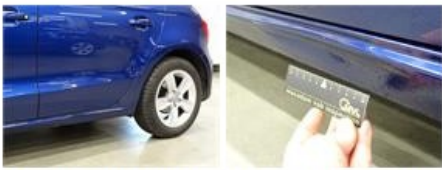
Alloy rim F L, Scratch(es), LI - Repair and paint (complete)