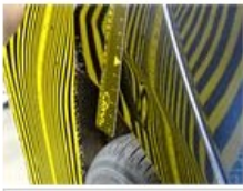
Trunk lid covering R, Scratch(es), E - Replace