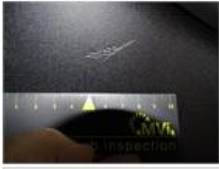
Door F R, Dent(s), LI - Repair and paint (complete)