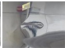
Door R R, Repaired, Acceptable