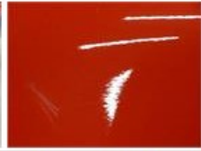
Rearview mirror housing R, Scratch(es), Smart repair