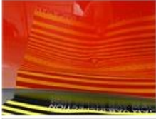
Wing R L, Bad repair, Acceptable