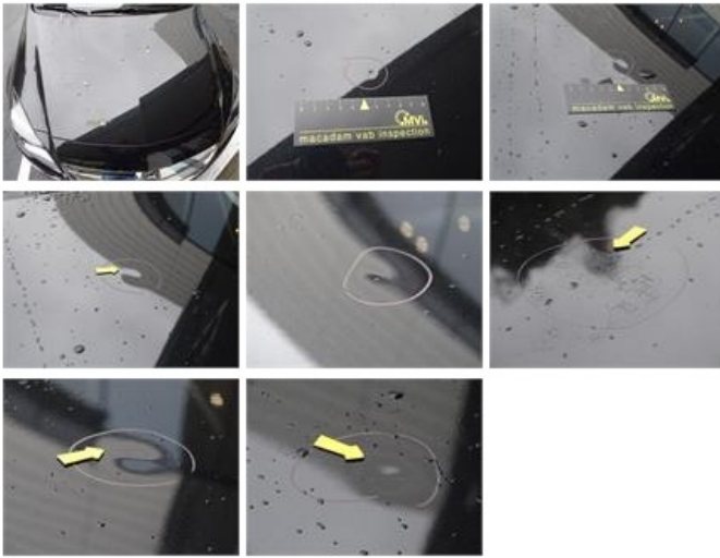
Bodywork, Damaged, Acceptable