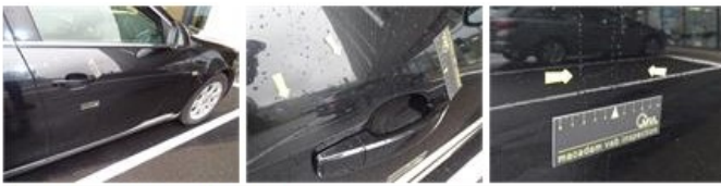
Wing R R, Scratch(es), 67 - Polish