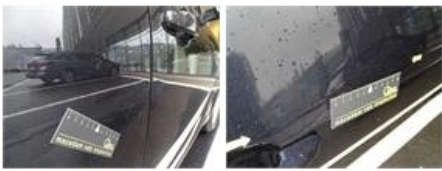
Bonnet, Hail damage, PDR - Hail