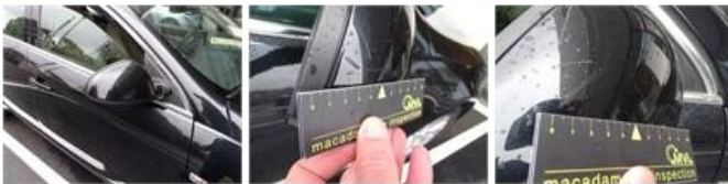
Roof pillar R, Hail damage, PDR - Hail