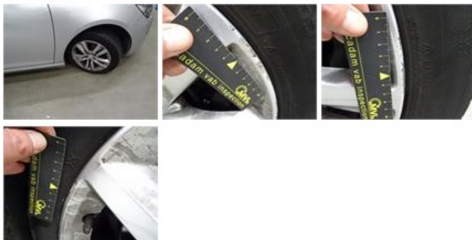
Alloy rim F L, Scratch(es), LI - Repair and paint (complete)