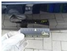
Windscreen, Stone chip(s), Windscreen repair