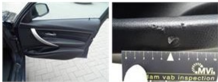
Door R L, Dent(s), Acceptable