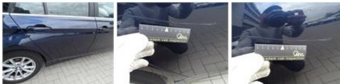
Door F R, Scratch(es), Acceptable