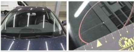
Bumper R, Dent(s), LI - Repair and paint (complete)