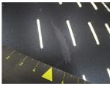
Bumper R, Dent(s) and scratch(es), LI - Repair and paint (complete)