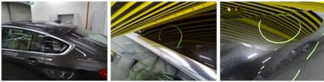
Bonnet, Hail damage, PDR - Hail