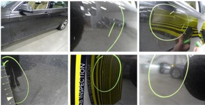
Bumper R, Scratch(es), It - Spot repair