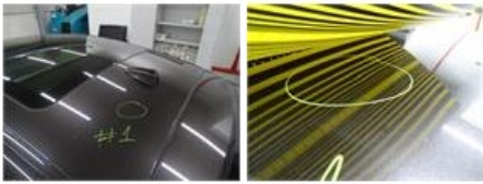
Roof pillar L, Hail damage, PDR - Hail