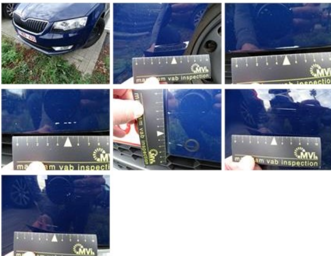
Tailgate, Scratch(es), LI - Repair and paint (complete)