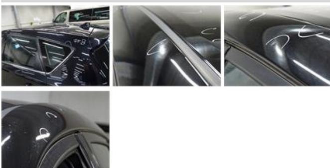
Door F R, Scratch(es), LI - Repair and paint (complete) 318,35