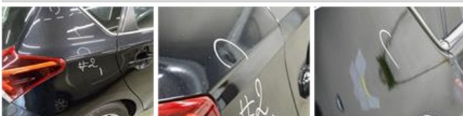
Roof pillar L, Hail damage, PDR - Hail 200,00