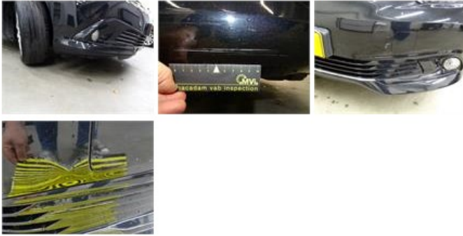
Wing F R, Hail damage, PDR - Hail 25,00