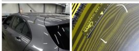
Door R R, Scratch(es), LI - Repair and paint (complete)