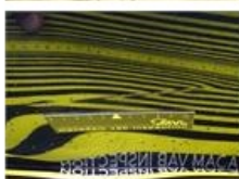
Alloy rim R L, Scratch(es), LI - Repair and paint (complete)