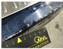
Wing R L, Scratch(es), LI - Repair and paint (complete)