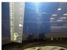
Door F L, Dent(s), LI - Repair and paint (complete)