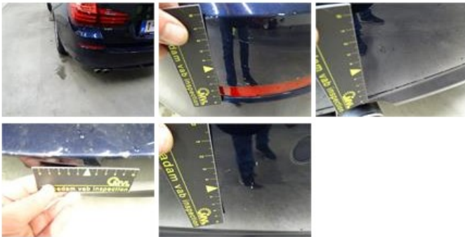
Bumper F, Scratch(es), LI - Repair and paint (complete)