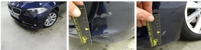
Alloy rim R R, Scratch(es), Acceptable