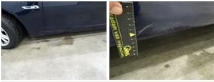
Door F L, Scratch(es), LI - Repair and paint (complete)