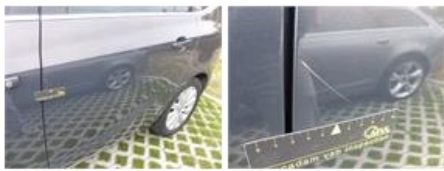
Trunk lid covering R, Scratch(es), Smart repair