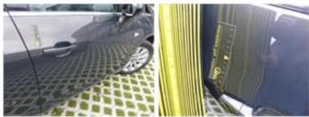
Door F L, Scratch(es), Acceptable