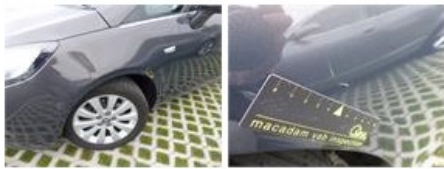
Alloy rim F R, Scratch(es), Acceptable