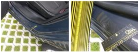
Door R R, Dent(s) and scratch(es), Acceptable