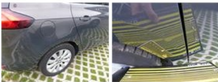
Bumper spoiler F, Scratch(es), E - Replace