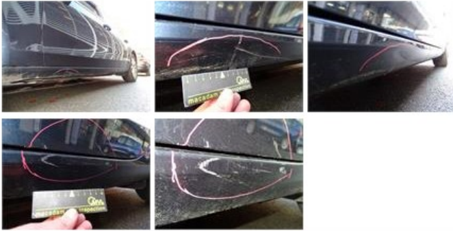
Wing R R, Dent(s) and scratch(es), LI - Repair and paint (partial)