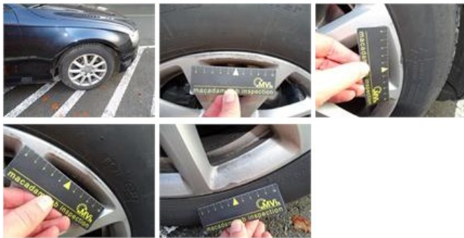
Bodywork, Damaged, Acceptable