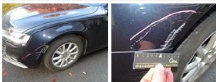
Bonnet, Scratch(es), LI - Repair and paint (complete)