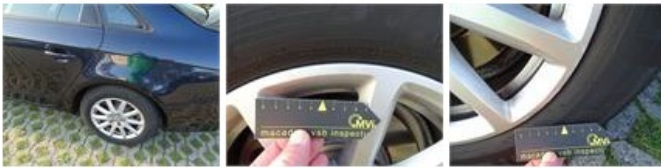
Wing R R, Scratch(es), Acceptable