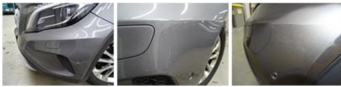
Wing R R, Scratch(es), LI - Repair and paint (complete)