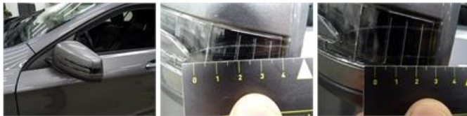
Door R R, Scratch(es), LI - Repair and paint (complete)