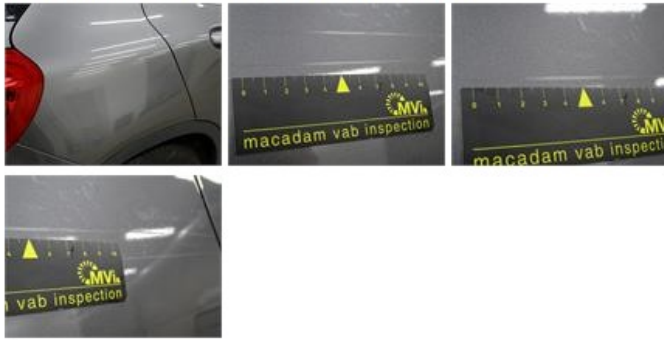
Bonnet, Scratch(es), LI - Repair and paint (complete)