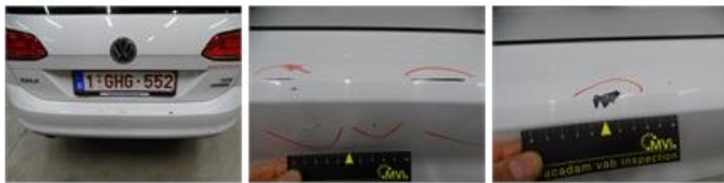
Bodywork, Not original part, Acceptable