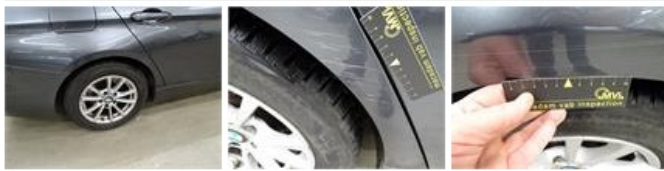
Door F R, Scratch(es), LI - Repair and paint (complete)