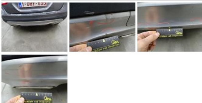
Door R L, Dent(s) and scratch(es), LI - Repair and paint (complete)