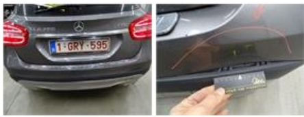
Rear spoiler, Chemical pollution, LI - Repair and paint (complete)