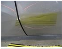
Door F L, Dent(s) and scratch(es), LI - Repair and paint (complete) 382,02