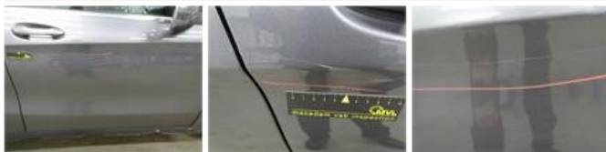
Wing F R, Scratch(es), LI - Repair and paint (complete)