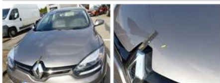
Bumper F, Scratch(es), LI - Repair and paint (complete)