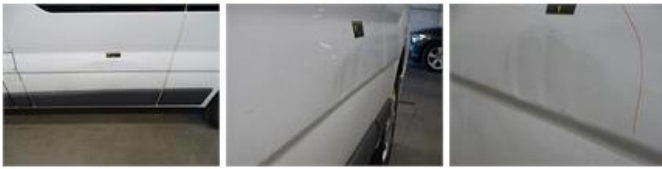
Roof, Dent(s), LI - Repair and paint (complete)