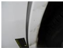
Bumper F, Broken, E - Replace