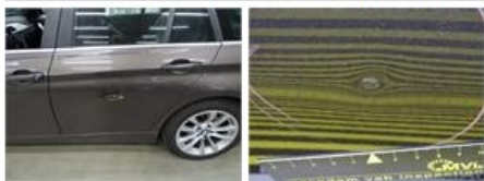
Door R R, Dent(s), LI - Repair and paint (complete)