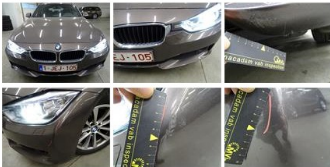
Alloy rim R L, Scratch(es), LI - Repair and paint (complete)