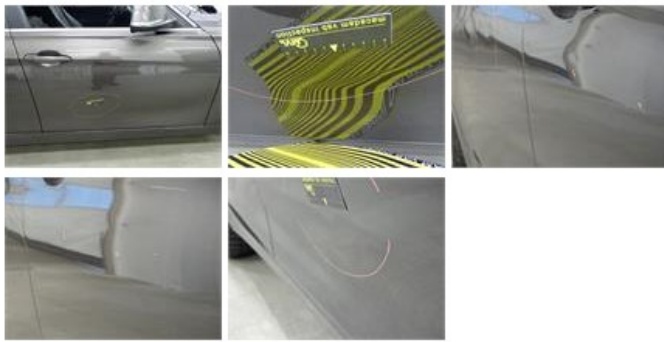
Bumper F, Scratch(es), LI - Repair and paint (complete)