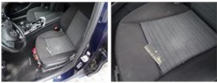
Seat cover R, Stain, Cleaning