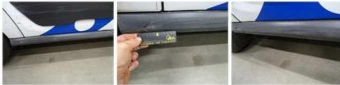
Door moulding Lower R R, Scratch(es), E - Replace