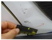
Windscreen, Stone chip(s), Windscreen repair