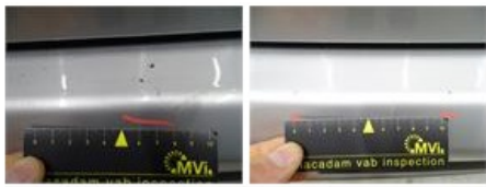
Door R R, Scratch(es), LI - Repair and paint (complete)