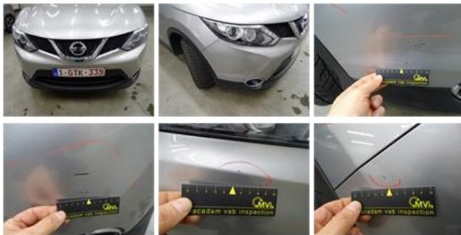
Wing R L, Scratch(es), Acceptable