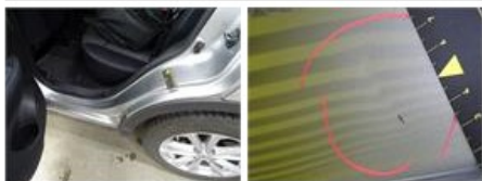
Wing F L, Scratch(es), Acceptable