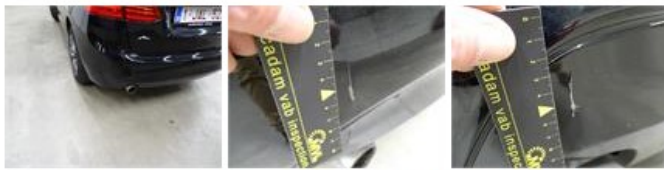
Bonnet, Chemical pollution, LI - Repair and paint (complete)