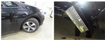
Bumper R, Crack, Le - Replace and paint