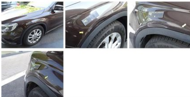
Bumper F, Dent(s) and scratch(es), LI - Repair and paint (complete)