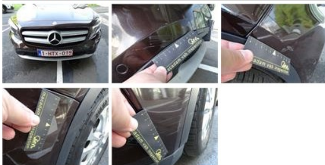
Alloy rim F L, Scratch(es), Acceptable