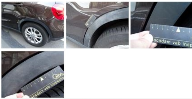
Wing moulding F L, Deformed / Strained, E - Replace