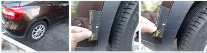
Outer valance R, Scratch(es), E - Replace