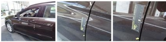
Wing trim R R, Scratch(es), E - Replace