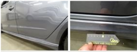
Bumper trim R, Dent(s) and scratch(es), E - Replace