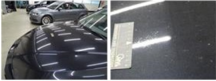
Rear window, Scratch(es), E - Replace 370,00